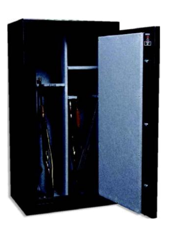
GUN SAFE / VAULT

The Grand Rapids Public Schools department of Public Safety does not endorse any type or manufacturer of gun safes or locks.